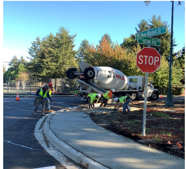
Highmark Pouring Sidewalk and ADA Ramp on Israel Rd. & New Market St.

Department Assistant II | 10/2/2023, 1 yr.