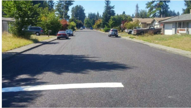
Fig 1: Completed Chipseal on Y Street SE

Total completed in 2016 = 286,110 square feet for chipseal and fogseal