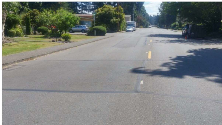
Fig 2: Completed Crack Seal on Hoadly Street SE

Total = 28,466 lineal feet of crack seal