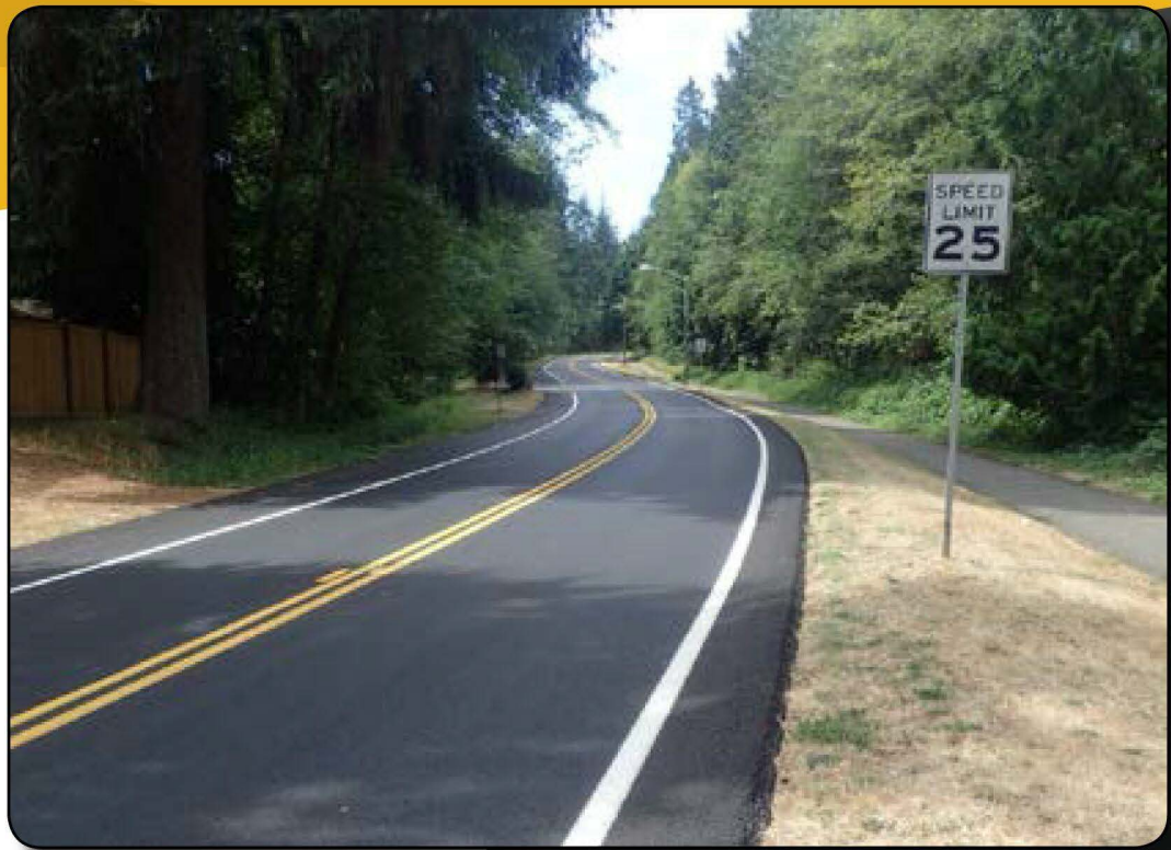
Fig 2: Completed Overlay - Somerset Hill Road