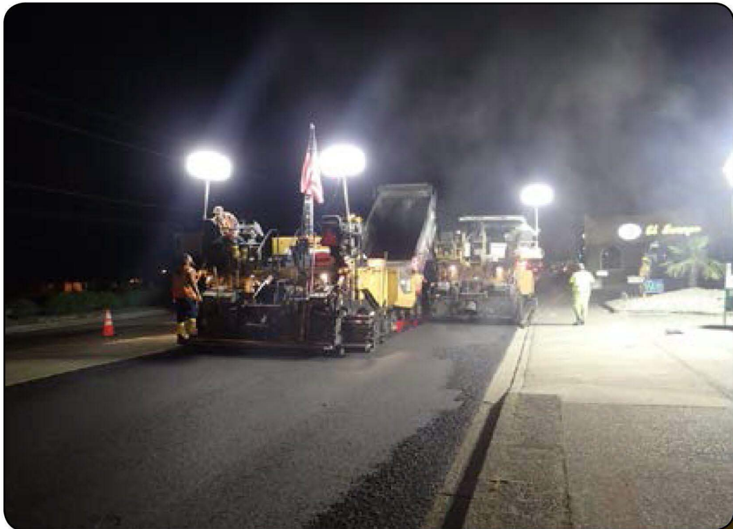
Fig 1: Capitol Blvd – Night Paving