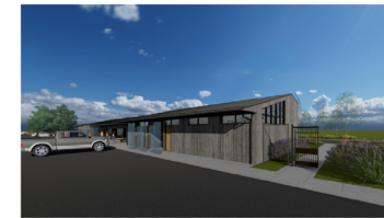
BUILDING A - NORTHWEST VIEW