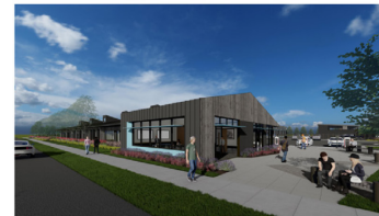
BUILDING A - SOUTHEAST VIEW