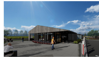
BUILDING A - NORTHEAST VIEW