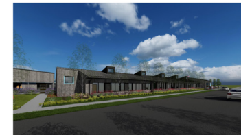
BUILDING A - SOUTHWEST VIEW