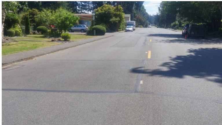
Fig 2: Completed Crack Seal on Hoadly Street SE

Total = 28,466 lineal feet of crack seal