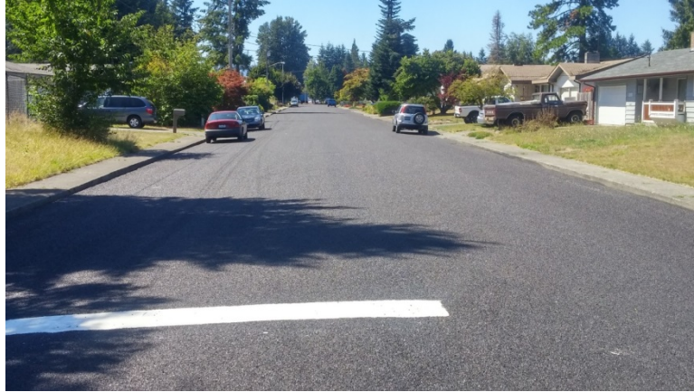
Fig 1: Completed Chipseal on Y Street SE

Total completed in 2016 = 286,110 square feet for chipseal and fogseal